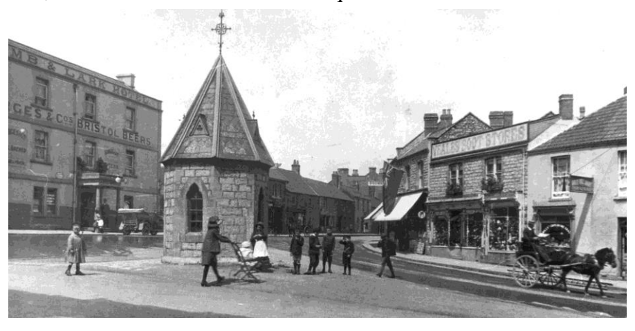
Above, Fig. 3 – On the left the Lamb & Lark Hotel, now Somerfields. Below, Fig. 4 – In the centre, Woodbine Cottages now demolished

"Lamb and Lark Hotel" (Ronto's & Somerfield site. Fig 3), be approached was turned down. After lengthy considerations, in June 1902, it was decided that none was required.