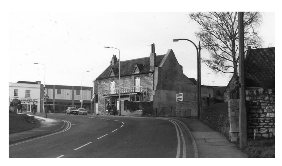
Fig.2. - The former Liberal Club on Bath Hill

The following year, drainage was on the agenda again, the parish protests being over-ridden by the local Government Board and the U.D.C. who insisted that a drainage scheme was imperative and that land should be compulsorily acquired for sewerage disposal. A parochial committee was set up and, eventually, on 26th October 1897, Horseham site (in Keynsham Hams between the railway line and River Avon) was chosen for the proper treatment of sewerage. Six months later, the public drain from the Liberal Club (on Bath Hill above the school. Fig 2) to the River was in a bad state. In 1900, objections were raised about sewerage going into the River Chew, so the new sewer from Charlton lane was to be kept out of the River Chew. The next section of the drainage scheme was to be taken from the back of the Church, through Back Lane to the side of the Parochial School. (This drain remained 'active' until 1988 as workmen obliterating the ancient Back Lane found to their cost - two of them having to be treated in hospital for fume inhalation.)