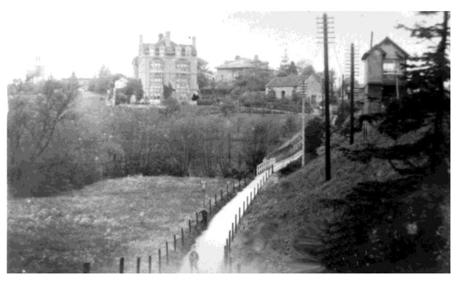
Fig. 6 – The footbridge over the Chew

By 1914, complaints were being received about stoppages in the old stone drain in Bristol Hill and the District Council advised replacing the stone drain with a new one from the top of the hill to Laura Villa.