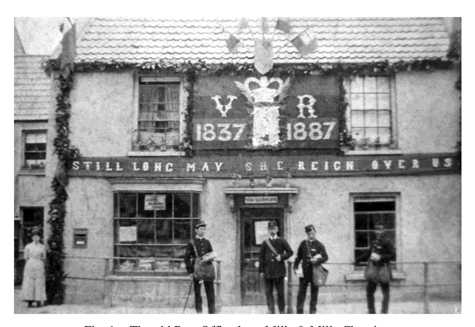
Fig. 1. - The old Post Office later Mills & Mills Chemists

The Sanitary Authority, on 20th December 1889, was considering the provision of a system of drainage for the town of Keynsham but they wished a public opinion poll for it. It was agreed that the sewers laid down some 15 years previously, were satisfactory