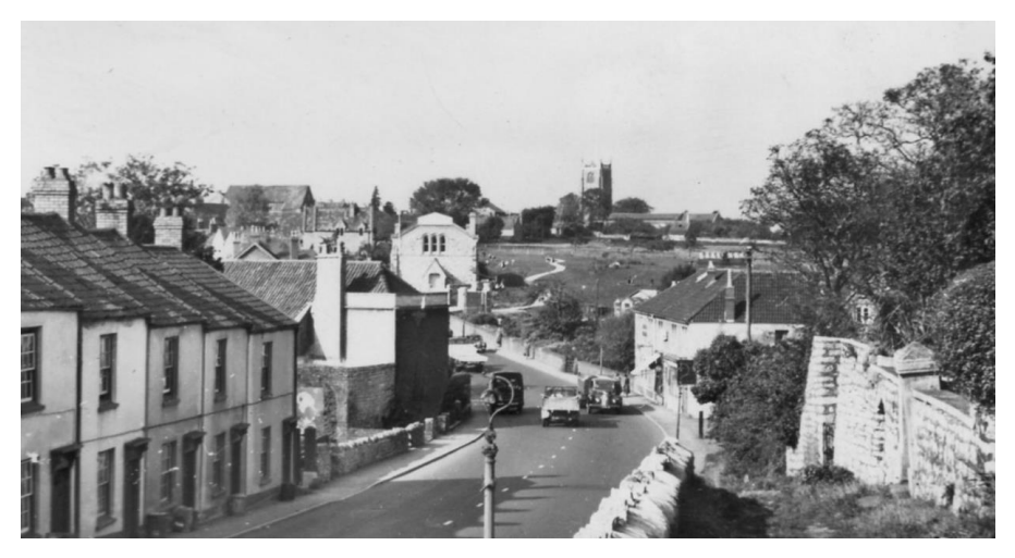
Bath Hill in the 1950's. In the centre of the picture are the shops next to Bath Hill Bridge and hidden by the tree is the Fox & Hounds Inn

The Fox & Hounds was adjacent to the row of shops which were demolished after the 1968 flood on the site of the present Fox & Hounds Lane.