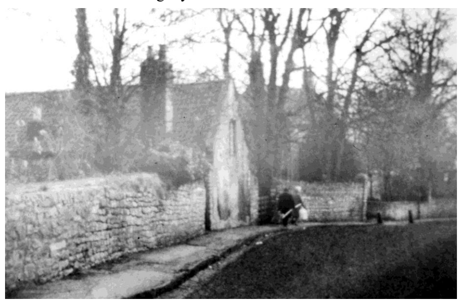
Fig. 5 – The Pines, Dapp's Hill.

All sewer sites were inspected early in 1905. It was decided that the sewer across the recreation ground (Hawthorns) was to connect with the Temple Street sewer, in return for an easement of sewerage from Charlton Park to be run through the new sewer in Messrs Thomas Willoughby's land.